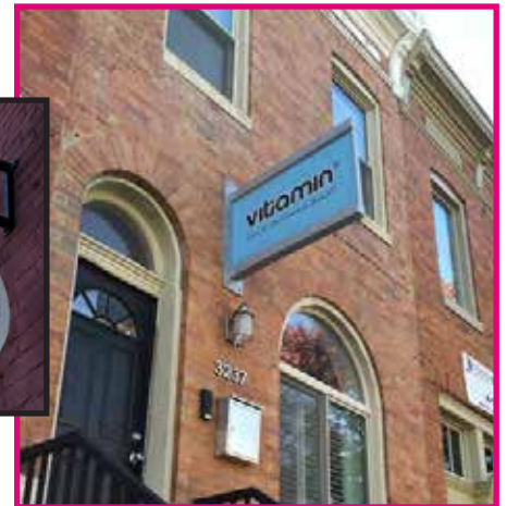
Blade signs from local businesses: Highlandtown Gallery and Vitamin.