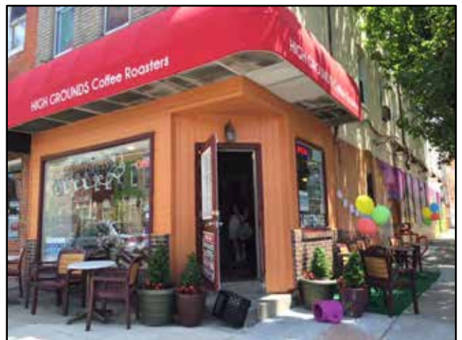
Completed awning at High Grounds Coffee Roasters, 3201 Eastern Ave.

(no funding will be given to unoccupied buildings)