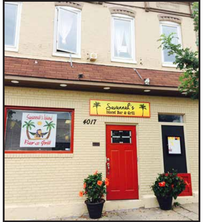
New sign, door, painting, and plants brighten Savannah's Island Bar & Grill at 4017 Eastern Ave.