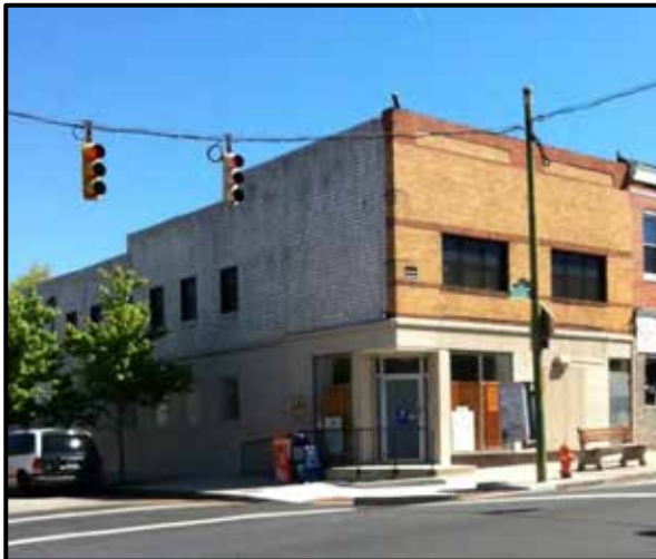
Before image of 3200 Eastern Avenue.

SIGNAGE * AWNINGS * WINDOWS * DOORS * CORNICE PAINTING * REPAIRS * EXTERIOR FINISHES * LIGHTING